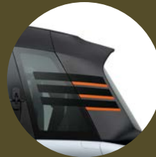
REAR QUARTER PANEL