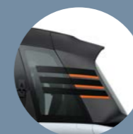
REAR QUARTER PANEL