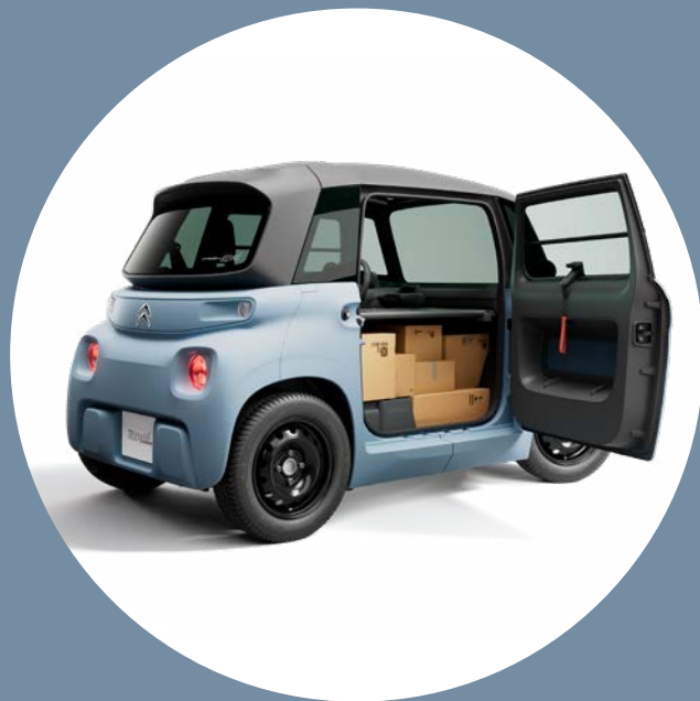
MY AMI CARGO