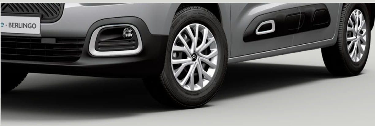
White Standard on ë-Berlingo & Berlingo Feel.

Colour packs include fog light surrounds and Airbump® curround on first capsule