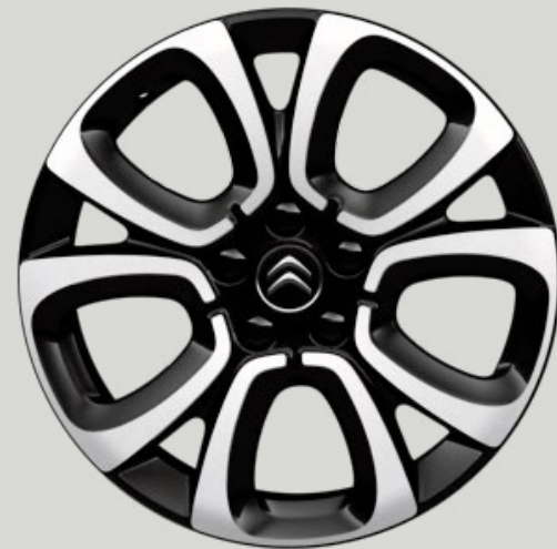
17 inch 'Spin' alloy wheels Standard on Flair XTR.