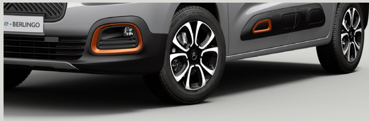
Orange Standard on ë-Berlingo & Berlingo Flair XTR.