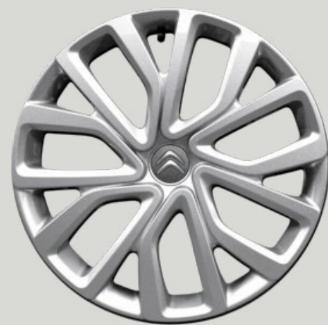
16 inch steel wheels with 'Twirl' wheel trims Standard on Feel.