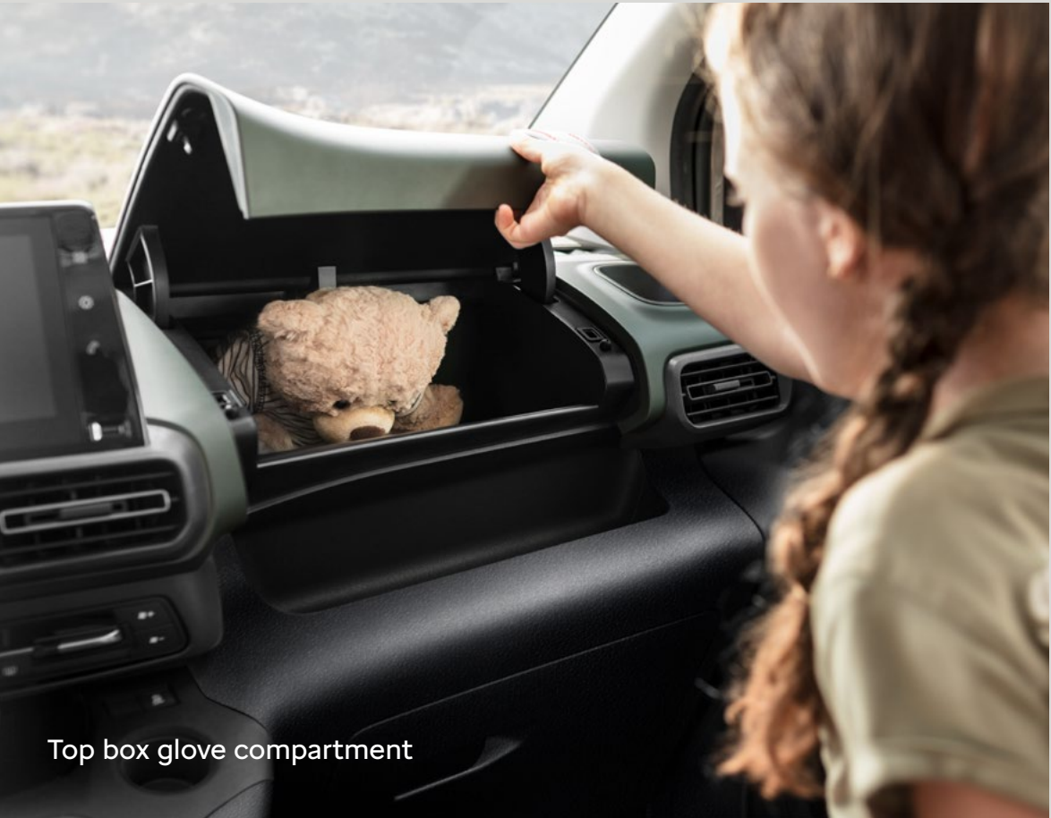
Top box glove compartment