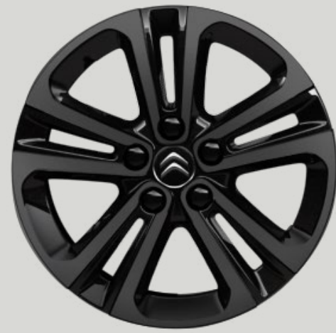
16 inch 'Starlit' alloy wheels Optional on Feel as part of Style Pack.