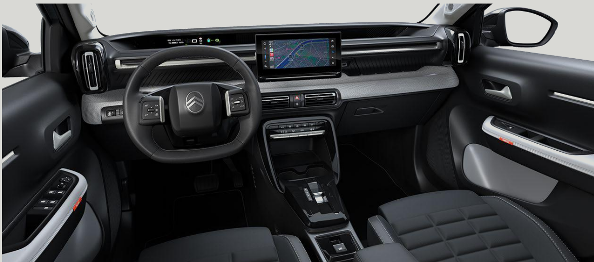
Metropolitan Grey interior ambience with Advanced Comfort Seats

Finished in Black 'Hello' weave and Light Grey leather-effect textile. Siderite Grey decorative elements on dashboard and front door panels. Front and rear door padded armrests with 'Happy Tags' labels.