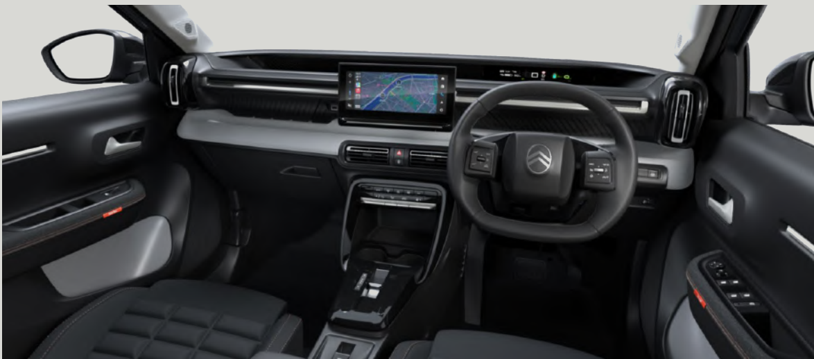
Urban Bronze interior ambience with Advanced Comfort Seats

Finished in black fabric and dark grey 'Quadric' fabric. Siderite Grey decorative elements on dashboard and front door panels.