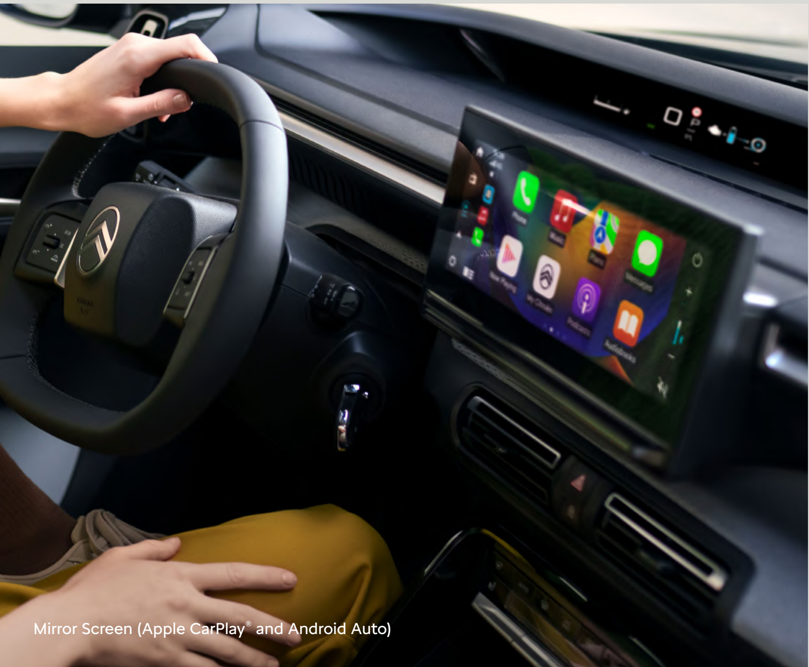
Mirror Screen (Apple CarPlay® and Android Auto)