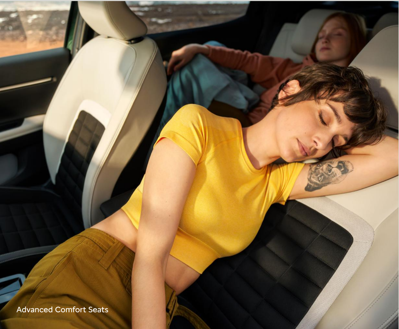
Advanced Comfort Seats