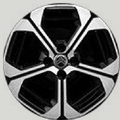
17 inch 'Aragonite' diamond-cut bi-tone alloy wheels