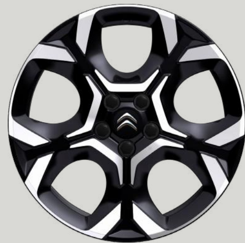
18 inch diamond-cut 'Pulsar' alloy wheels Standard on PLUS and MAX Edition.