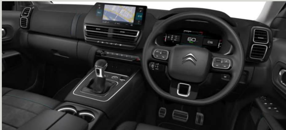
'Urban Black' interior ambience with black Alcantara® and leather-effect textile