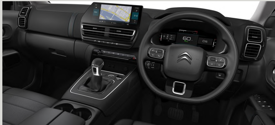
'Metropolitan Black' interior ambience with black cloth and grey leather-effect textile