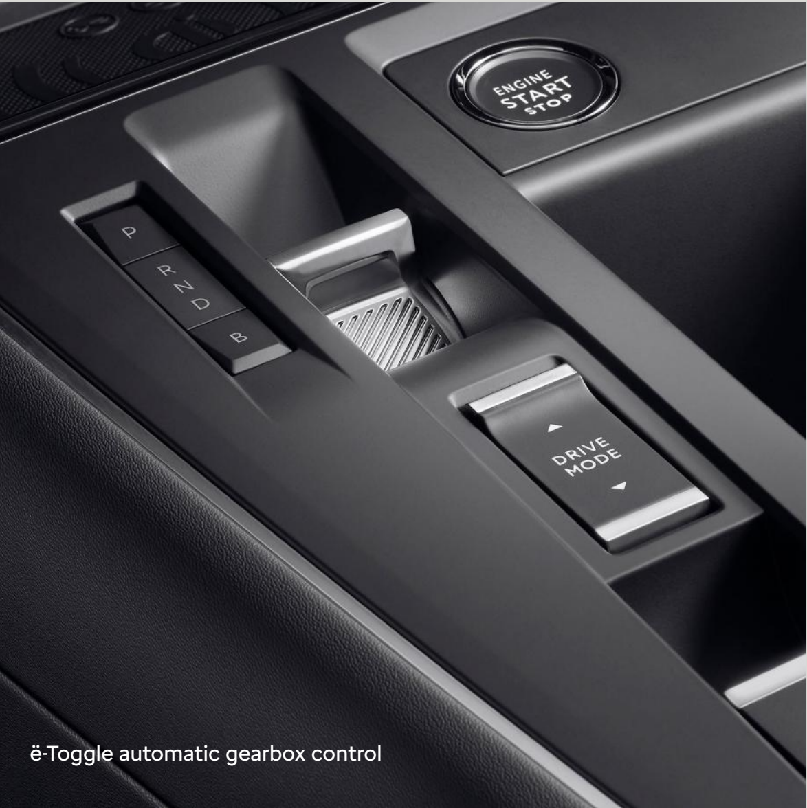
e-Toggle automatic gearbox control