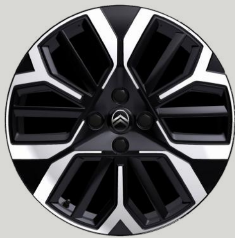
18 inch "Amber" alloy wheels Bi-tone (Orbital Black/Aluminium) finish with anti-theft locking wheel nuts Standard on all trims