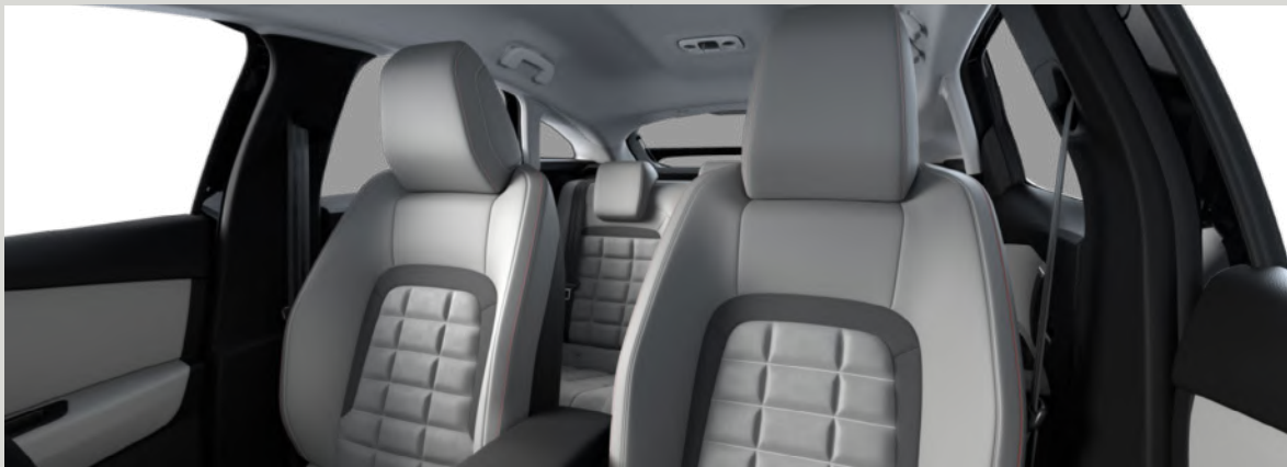
Alcantara interior ambience Optional on MAX Image shown for illustration only; does not reflect right-hand-drive UK version