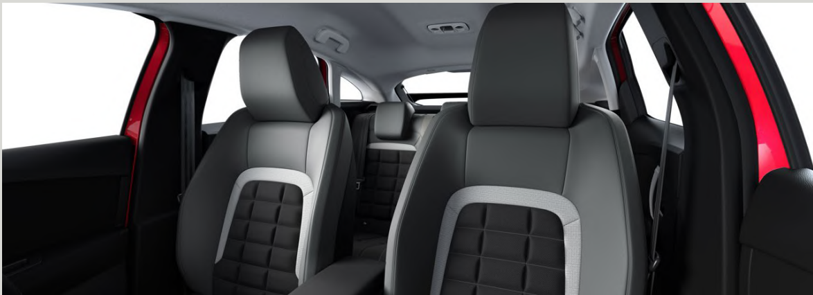
Urban Grey ambience Standard on YOU! and PLUS.