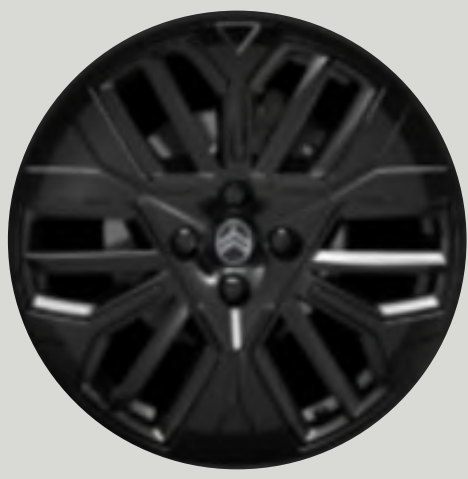
18 inch "Amber" alloy wheels Full black painted finish with anti-theft locking wheel nuts Optional on MAX