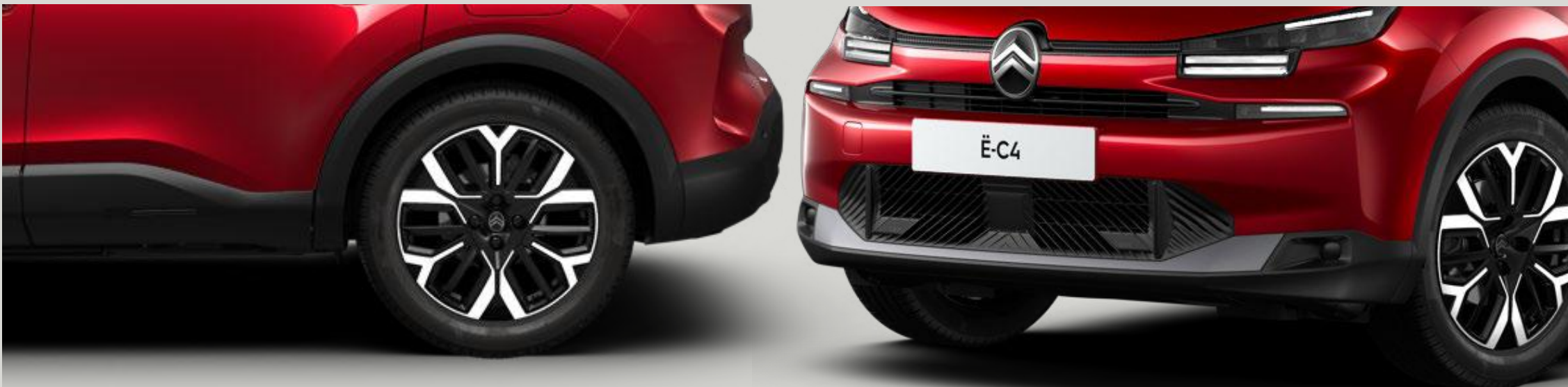
Glossy Black (standard on YOU! and PLUS)

Depending on the trim level chosen, your C4 features Colour Clips in the front lower bumper and on the rear side doors