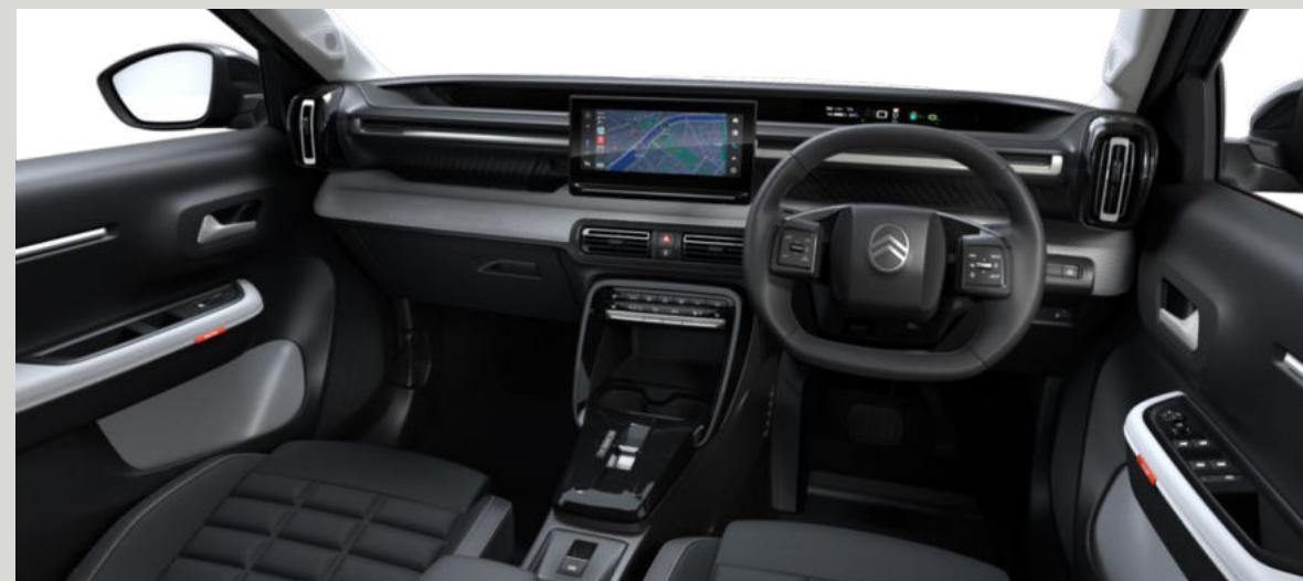
Urban Grey cloth Advanced Comfort Seats with Siderite Grey décor on dashboard and door trims