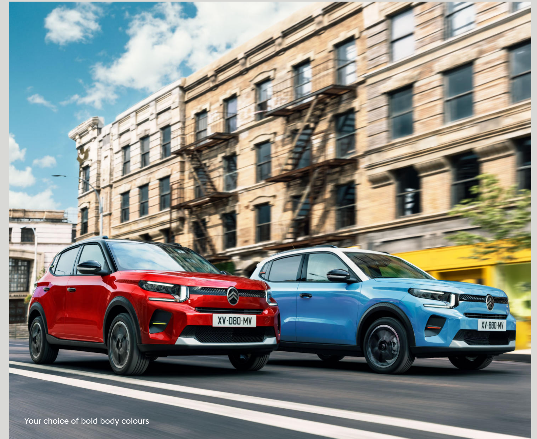
Your choice of bold body colours