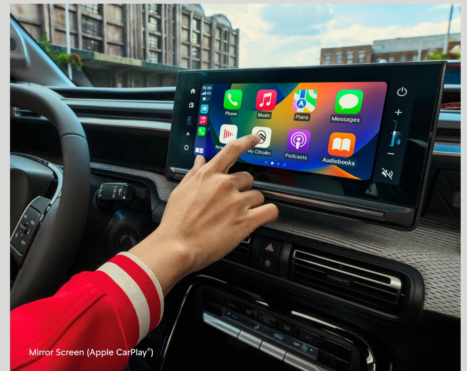
Mirror Screen (Apple CarPlay®)