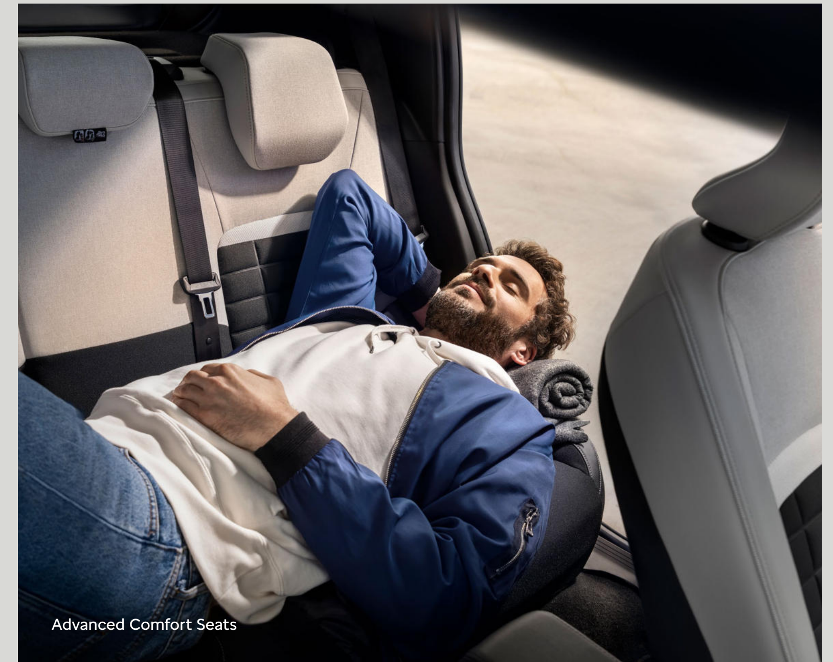
Advanced Comfort Seats