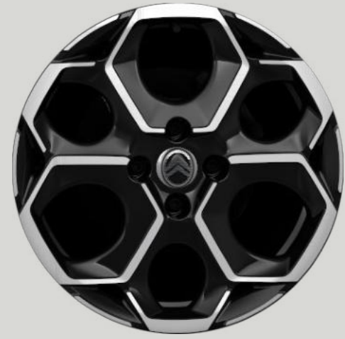
17 inch 'Atacamite' diamond-cut bi-tone alloy wheels