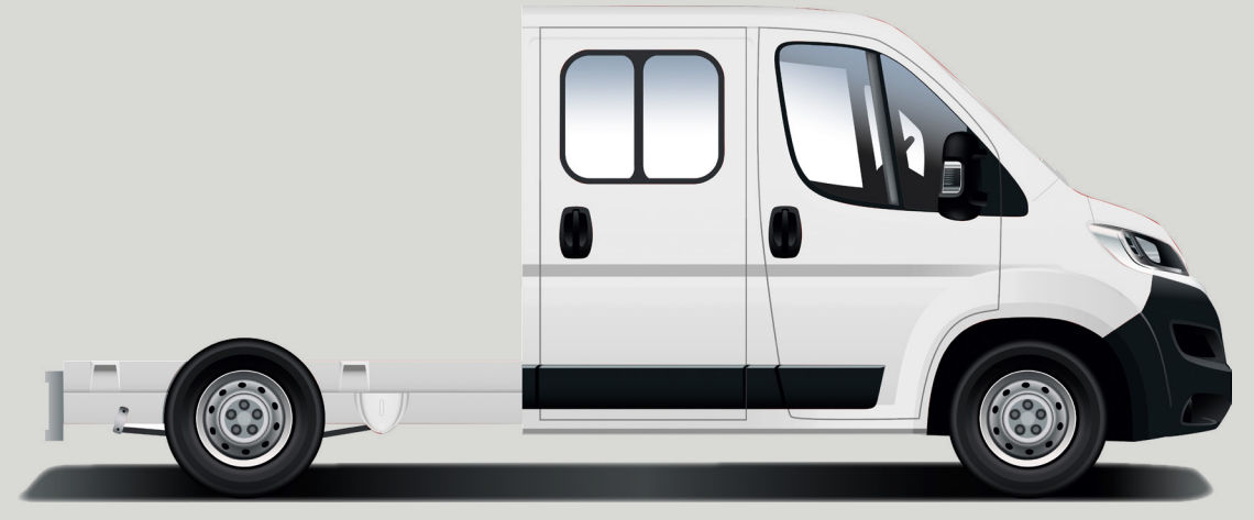
Citroën Relay Chassis Crew Cab