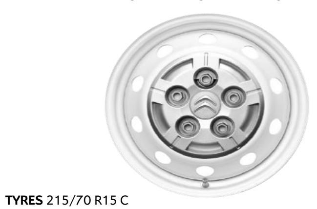
STANDARD STEEL WHEELS