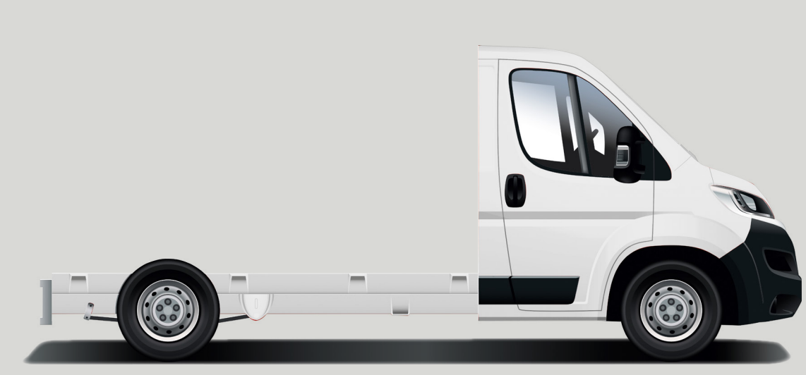
Citroën Relay Chassis Cab