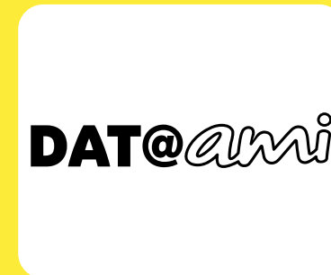
DAT@AMI for connecting your smartphone to Ami