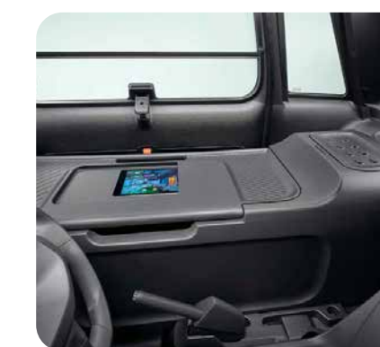
Mobile desk surface with A4 footprint, ideal for documents or tablet