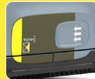
Lower door decals