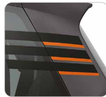
Rear window decals