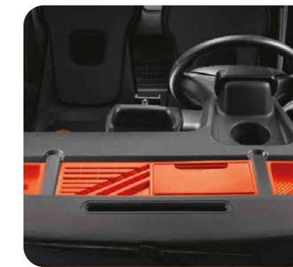
Dashboard storage boxes