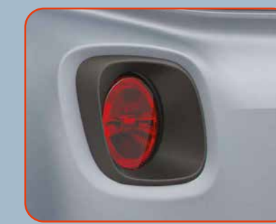
Black surrounds for rear lights