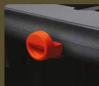
Dashboard bag hook on passenger side