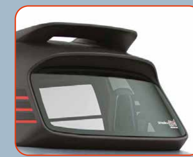
Black spoiler at the rear of the roof