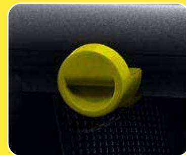
Dashboard bag hook on passenger side