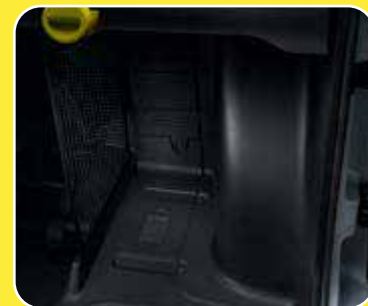
Black central separation net