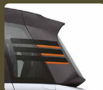
Rear window decals