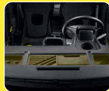
Dashboard storage boxes