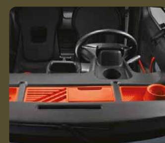
Dashboard storage boxes