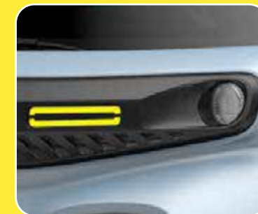
Black door nets with a horizontal band