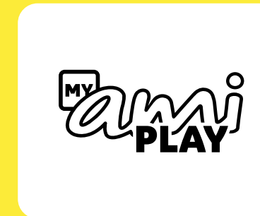
My Ami Play app and Citroën Switch button