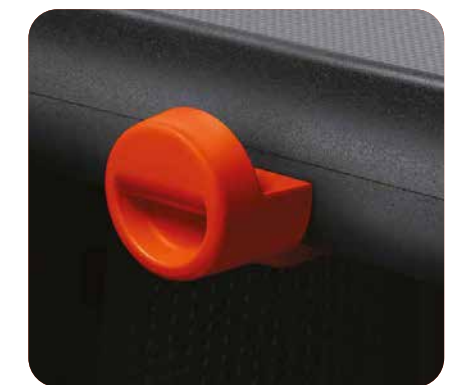
Dashboard bag hook on passenger side