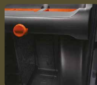
Black central separation net