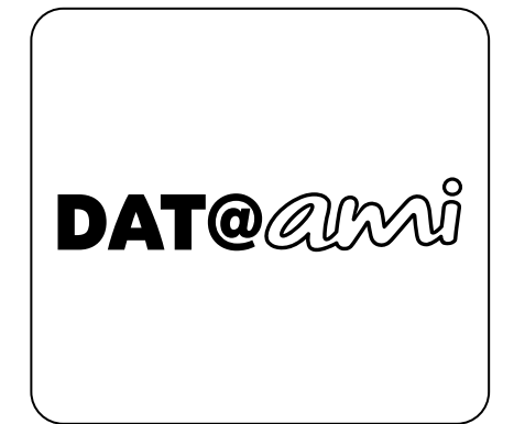
DAT@AMI for connecting your smartphone to Ami