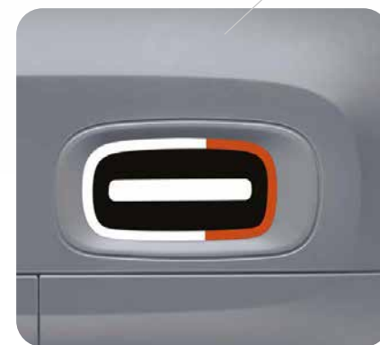
Lower door decals