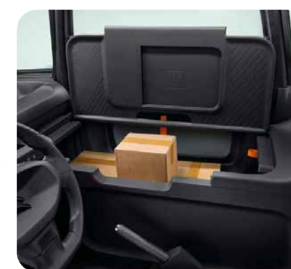
The upper surface is also the opening lid to the storage area