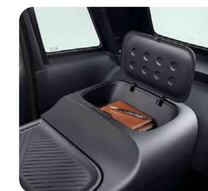
The separate rear storage area (with lid) is perfect for a mobile device