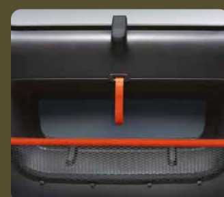
Black door nets with a horizontal band