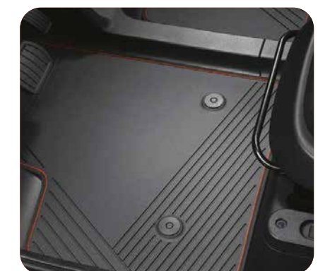
Black floor mats with colour-coded trim