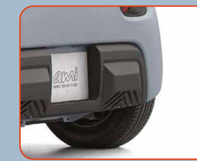
Black lower rear bumper