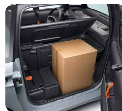
The flat floor can be adjusted to one of two positions