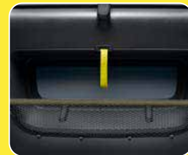
Black door nets with a horizontal band