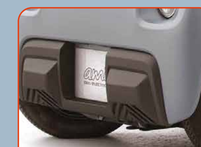
Black lower front bumper