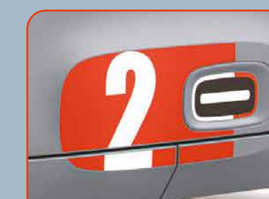
Orange lower door decals