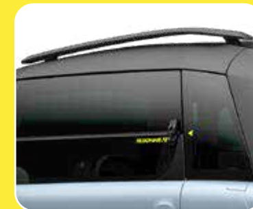
Rear window decals