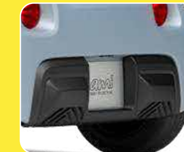
Black rear bumper