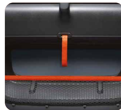
Black door nets with a horizontal band