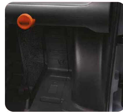
Black central separation net