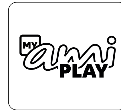
My Ami Play app and Citroën Switch button