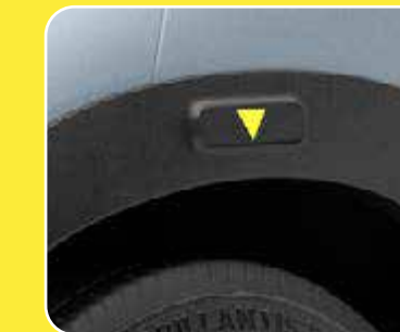
Wheel arch decals