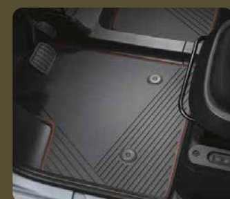
Black floor mats with colour-coded trim