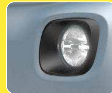
Black front light surrounds