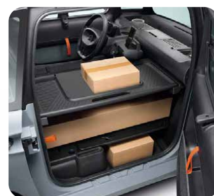
The surface can support a weight of up to 40 kg

A vertical divider separates the driver's space from the cargo area.