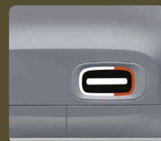
Lower door decals