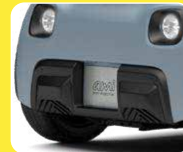
Black front bumper with yellow sticker