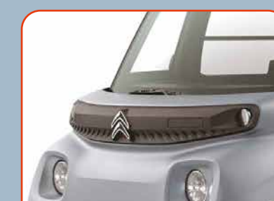
Black embellisher at top of front bumper