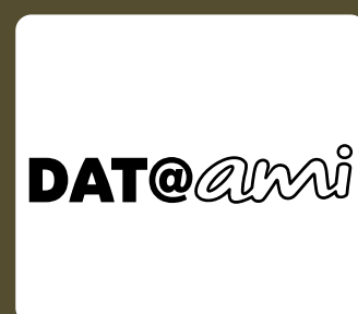
DAT@AMI for connecting your smartphone to Ami