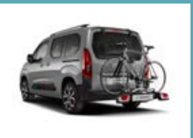
TOWBAR MOUNTED BIKE RACK