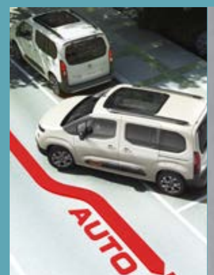
(2) CAN BE DEACTIVATED