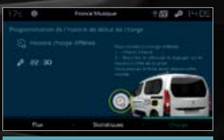
Deferred charging: forward schedule charging