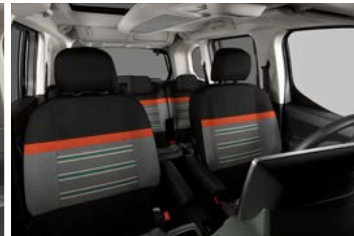
LINE GREEN CLOTH WITH RESADA GREEN AMBIENCE (Flair XTR Versions)