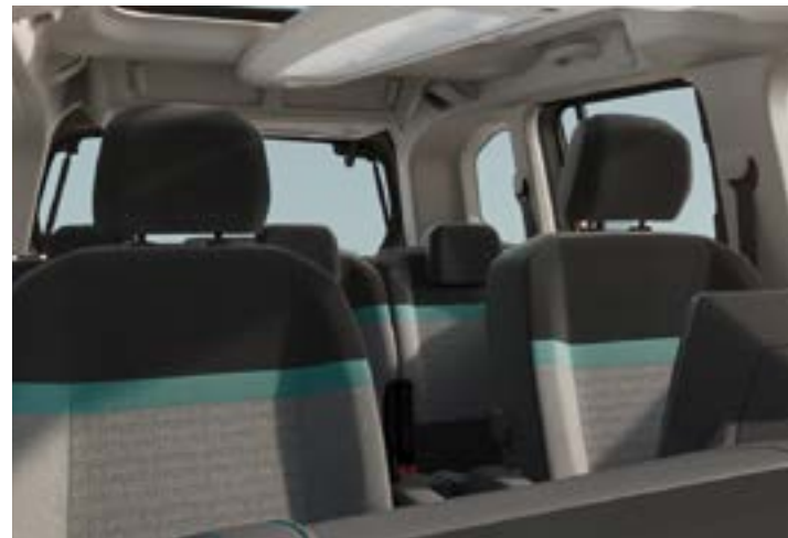
METROPOLITAN GREY CLOTH WITH STANDARD GREY AMBIENCE (Feel Versions)