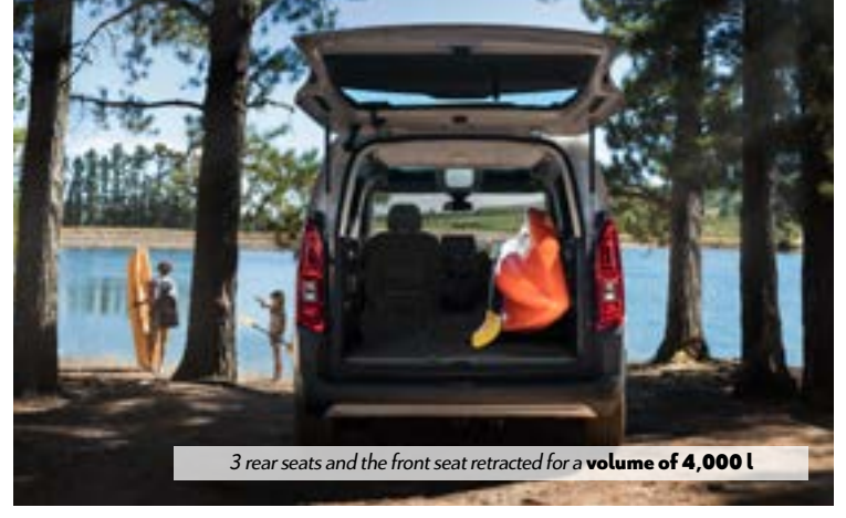
Imagery shown for illustration purposes only and may not reflect current UK specification. Please check with your Citroën Retailer at the time of ordering.