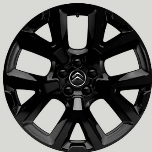
19 inch black 'Art' alloy wheels Standard on ë-series, optional on MAX.