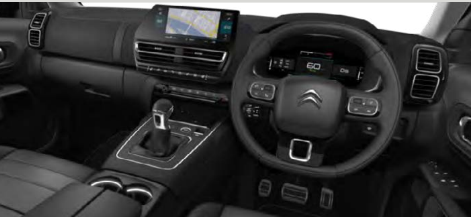
'Hype Black' interior ambience with black 'Nappa' leather and black leather-effect textile Optional on MAX.