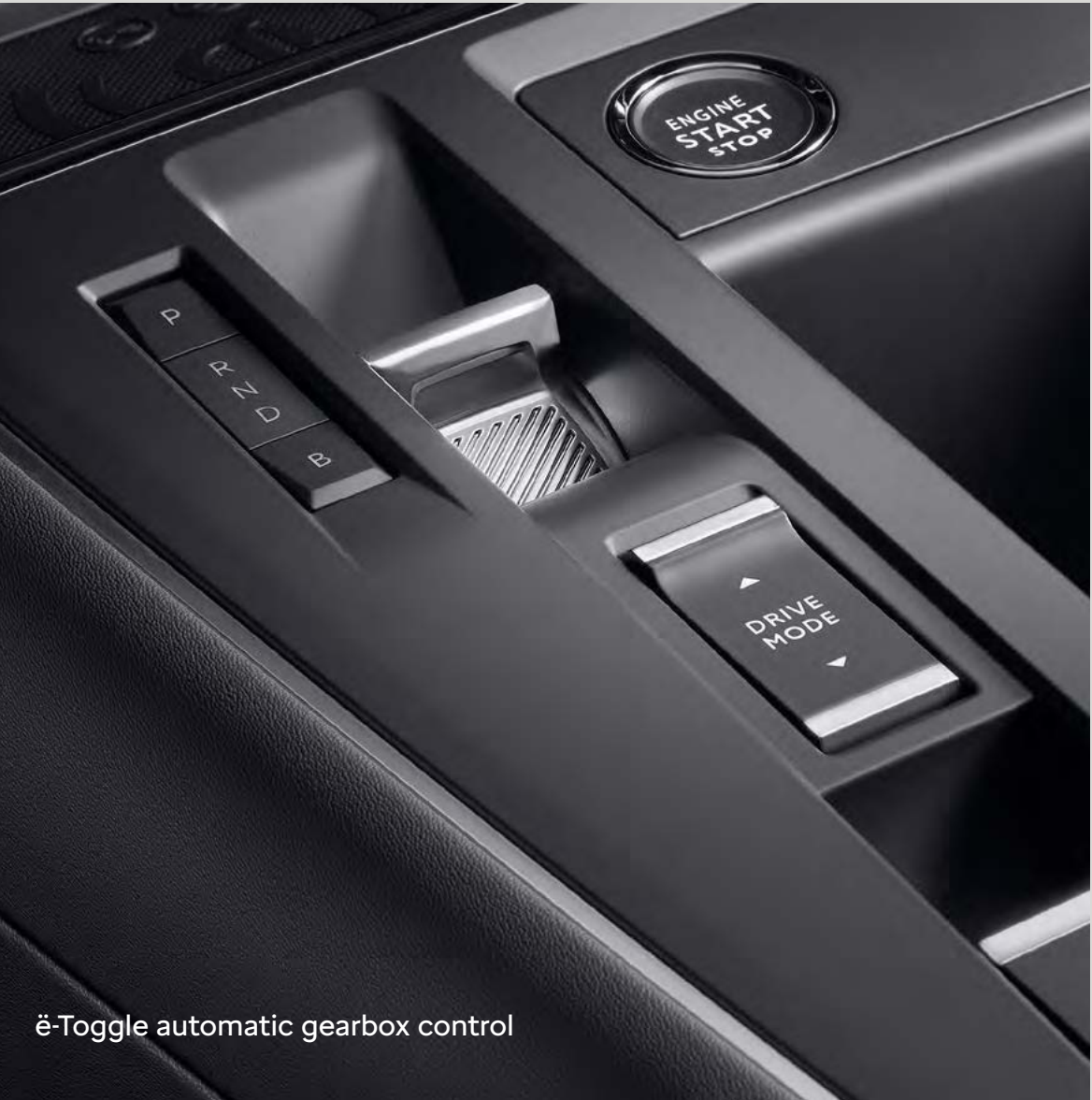
ë-Toggle automatic gearbox control