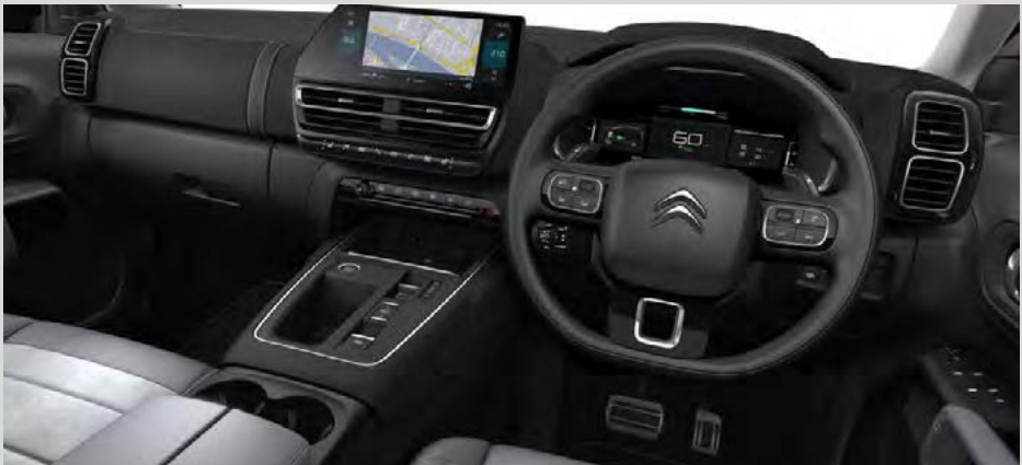
'ë-series' interior ambience with grey Alcantara® R-Evolution fabric and leather-effect textile Standard on ë-series.