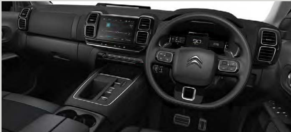
'Metropolitan Grey' interior ambience with black cloth and leather-effect textile Standard on MAX.