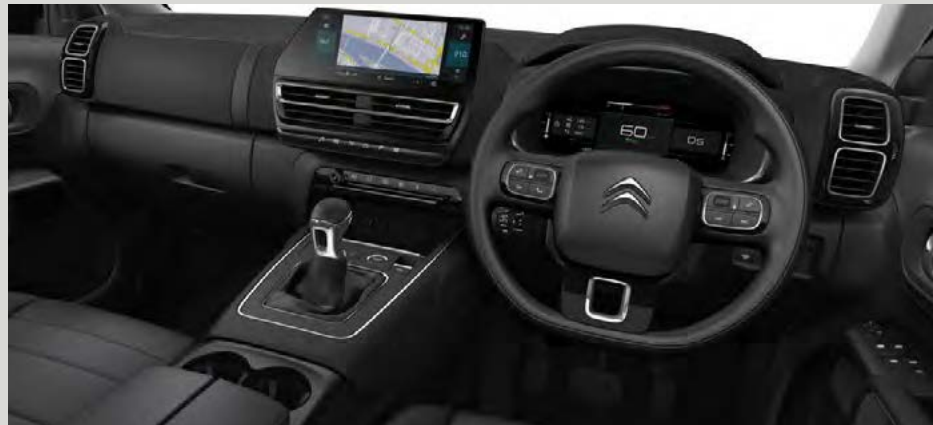
'Metropolitan Black' interior ambience with black cloth and grey leather-effect textile Standard on PLUS.