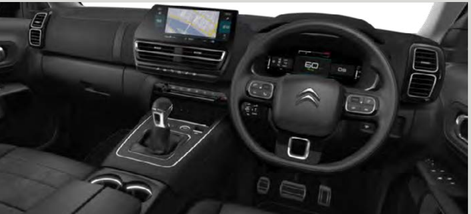
'Urban Black' interior ambience with black Alcantara® and leather-effect textile Optional on MAX and ë-series.