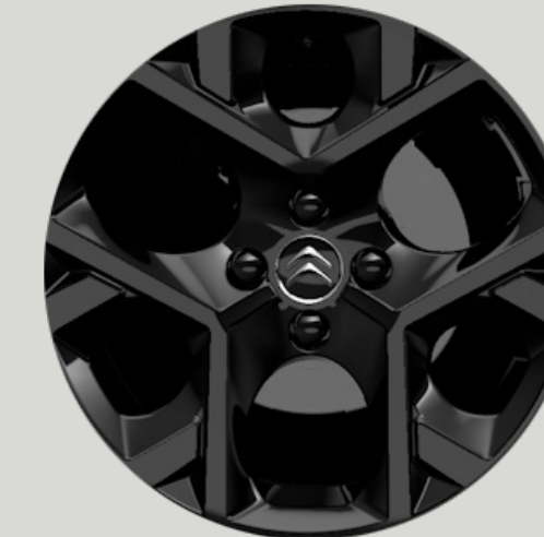
17 inch 'Origami' Black alloy wheels with all season tyres (215/50 R17) Optional on Shine Plus.