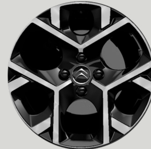
17 inch 'Origami' diamond-cut alloy wheels Standard on Shine Plus.