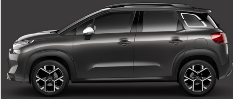
Platinum Grey (M)