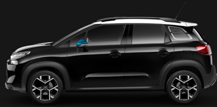
Perla Nera Black (M)