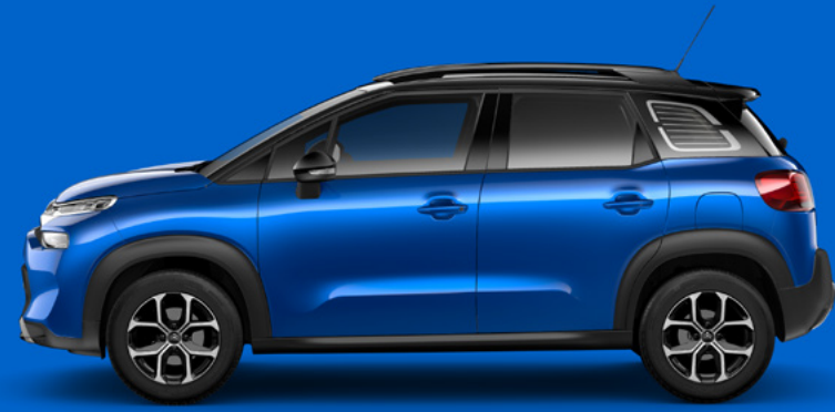
Voltaic Blue (M)