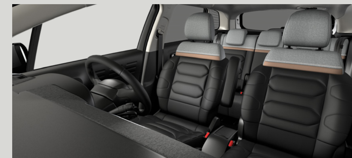
Metropolitan Graphite ambience Standard on Shine Plus, optional on Shine.