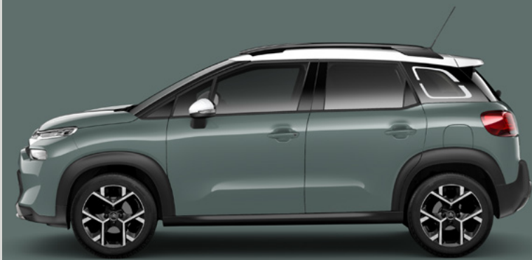
Khaki Grey (F)