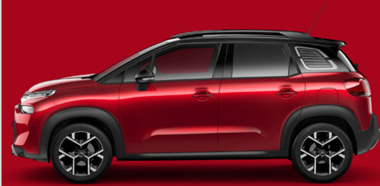
Pepper Red (M)