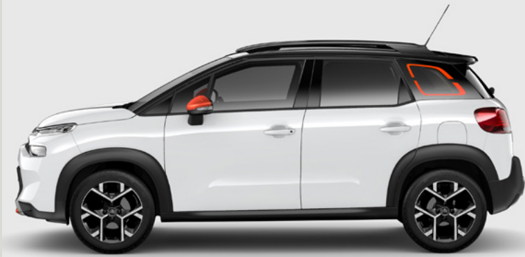
Polar White (F)