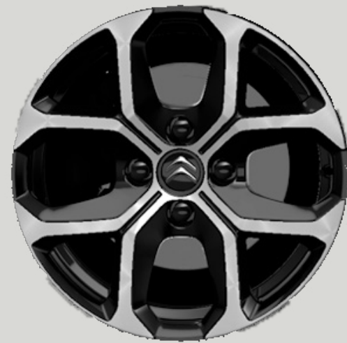
16 inch 'X Cross' diamond-cut alloy wheels Standard on Shine.