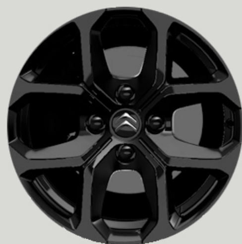
16 inch 'X Cross' full black alloy wheels Standard on C-Series Edition.