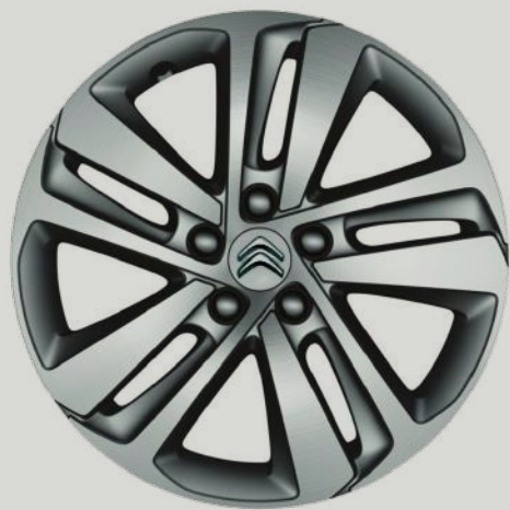
17 inch 'Phoenix' alloy wheels Optional on Enterprise and Driver.