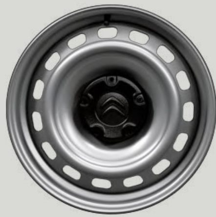
16 inch steel wheels with black centre cap Standard on Enterprise.