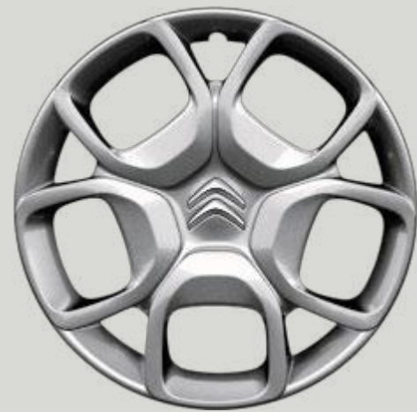
17 inch steel wheels with 'Pentagon' wheel cover Standard on Driver.